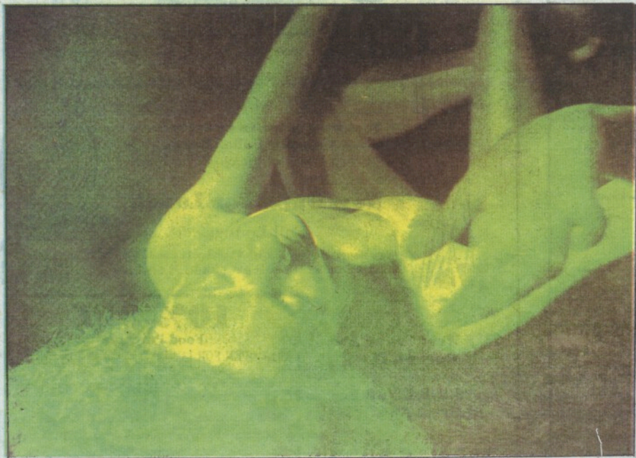
Edwina Orr's "Dream"