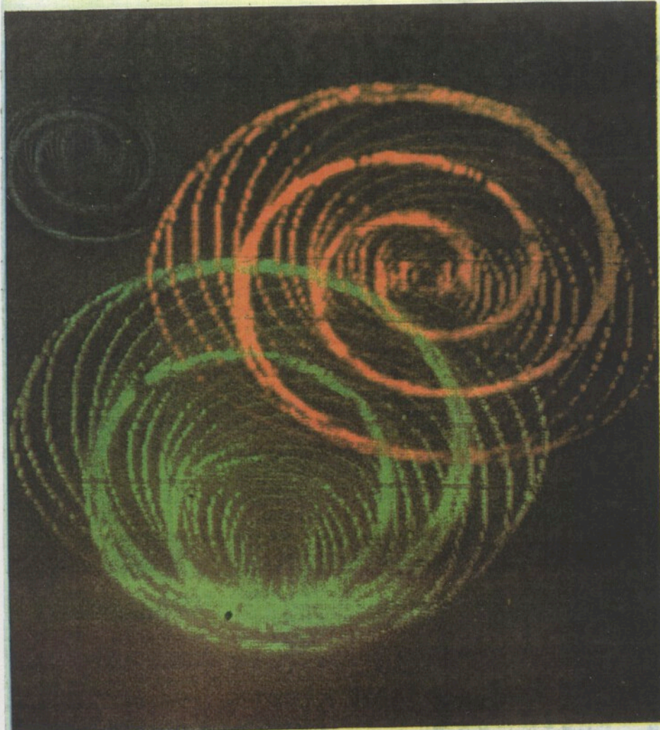
A computer origination hologram is featured at the museum