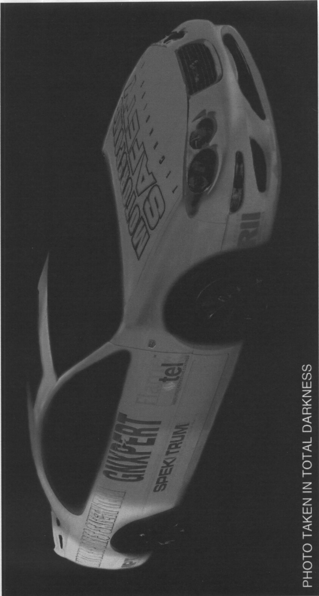
PHOTO TAKEN IN TOTAL DARKNESS