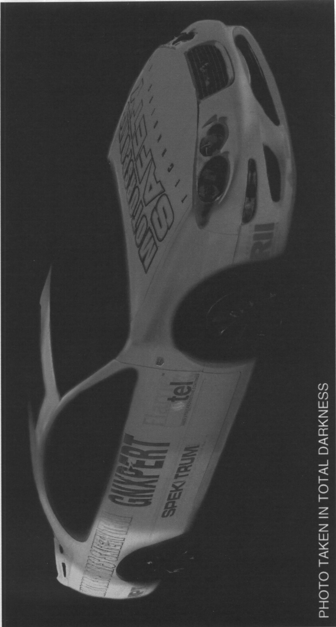
PHOTO TAKEN IN TOTAL DARKNESS