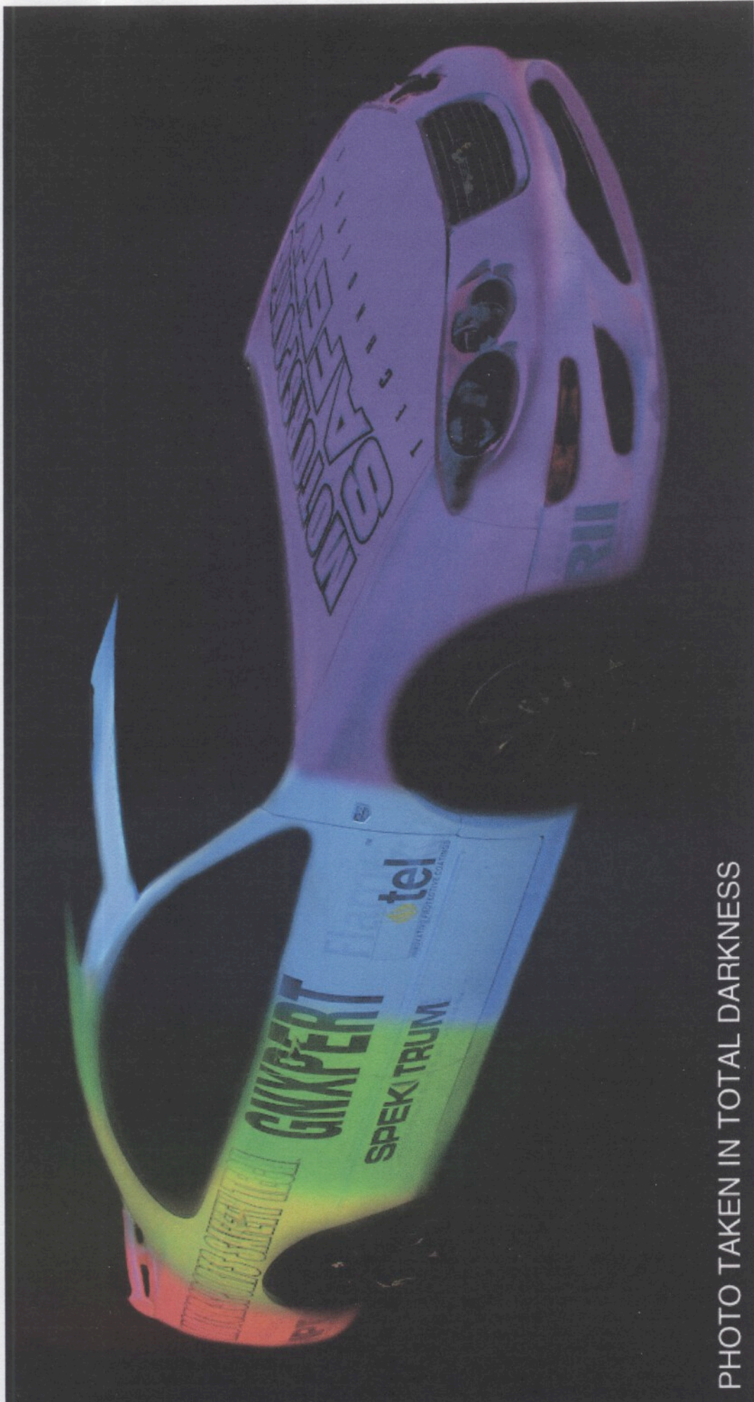
PHOTO TAKEN IN TOTAL DARKNESS