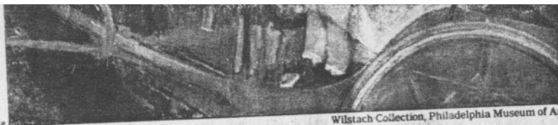
Wilstach Collection, Philadelphia Museum of Art

A powerful collection of art can be seen on the Near South Side, in the National Vietnam Veterans Art Mu-